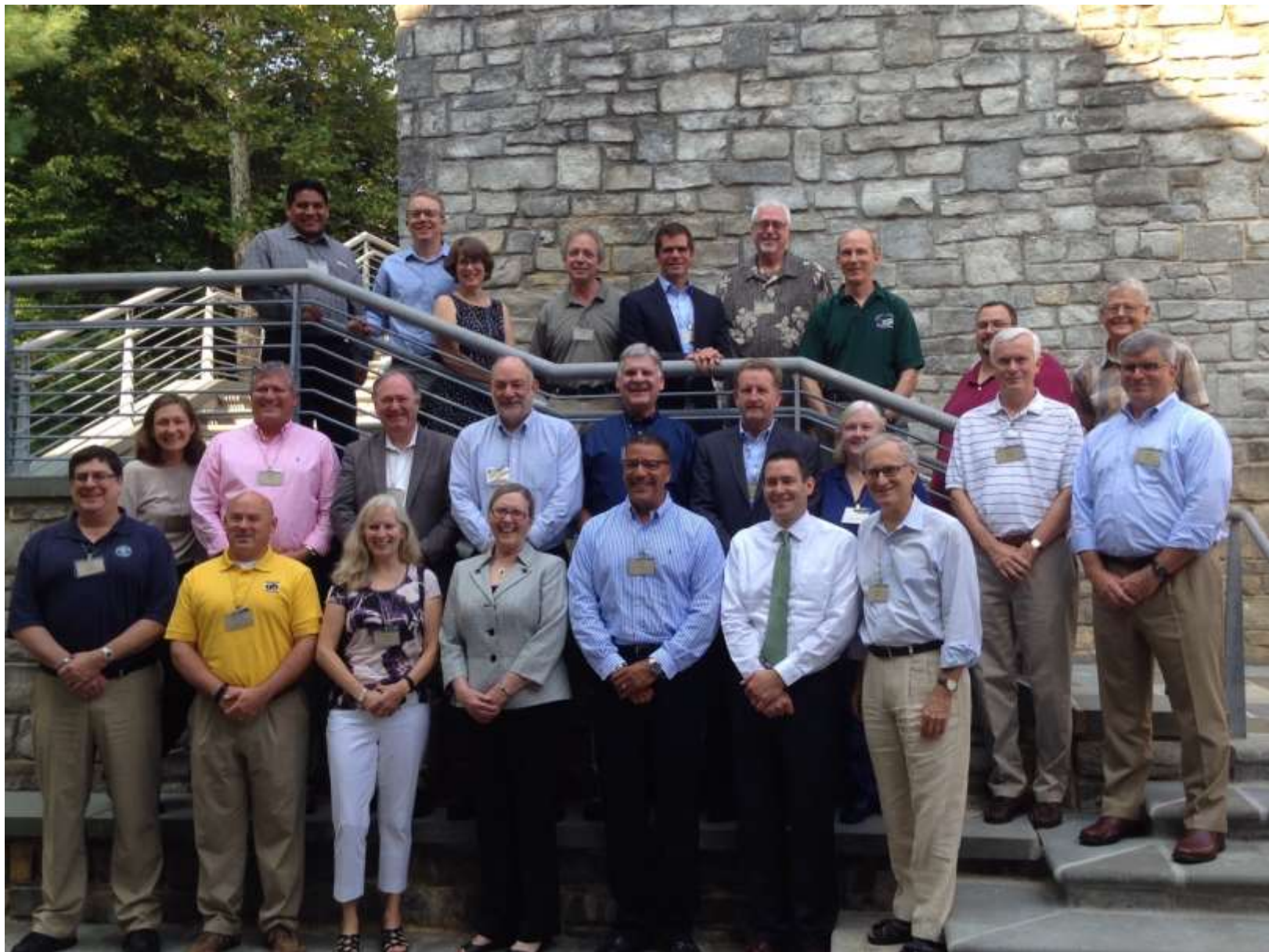
National Geospatial Advisory Committee