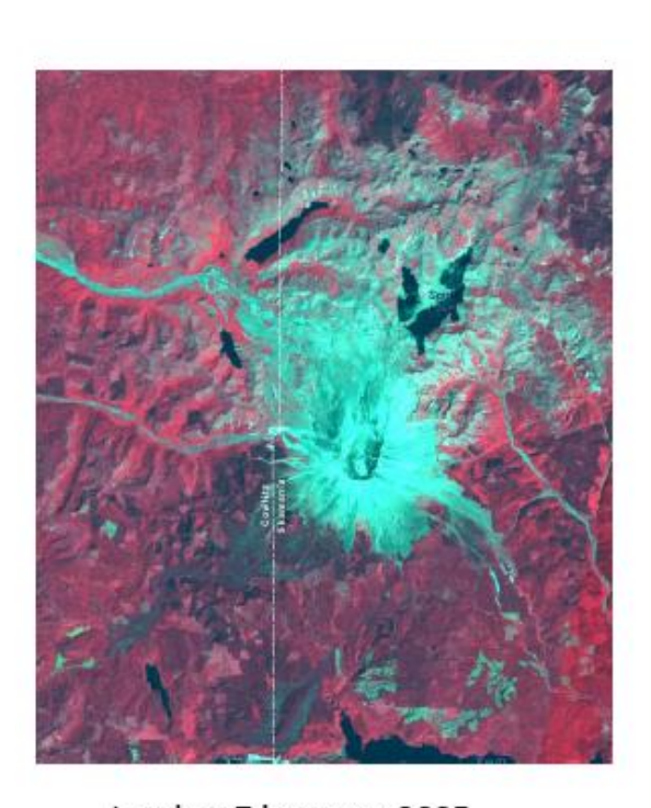
Landsat 7 imagery 2005