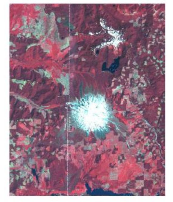
Landsat MSS imagery 1975