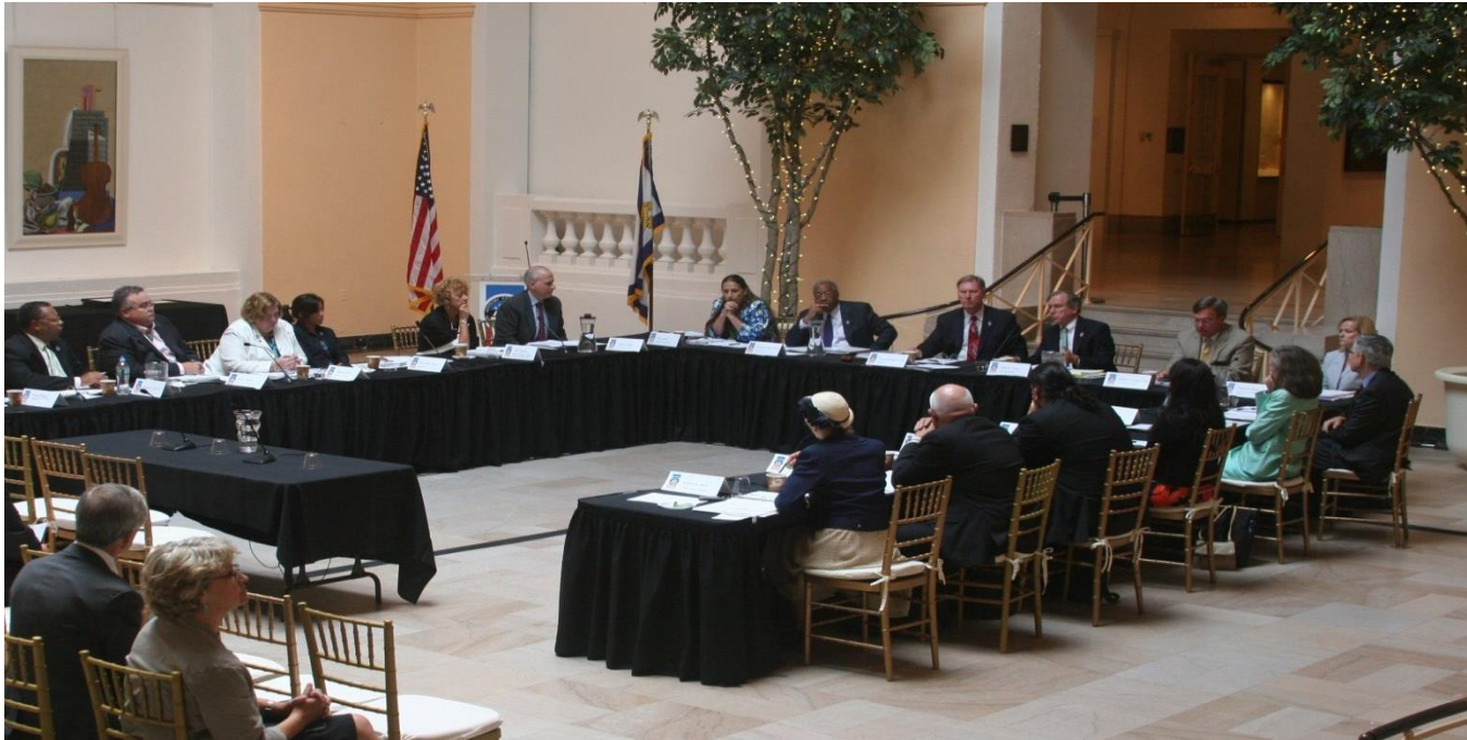
ACHP Business Meeting