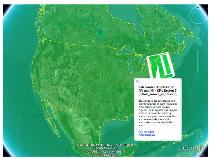
Figure 2 - KML Output in Google Earth Plugin