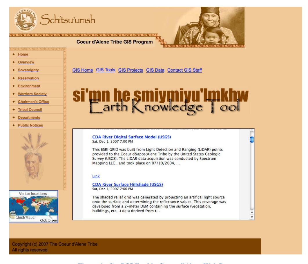
Figure 4 - GeoRSS Feed in Coeur d'Alene Web Page