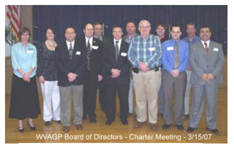
WVAGP Board of Directors