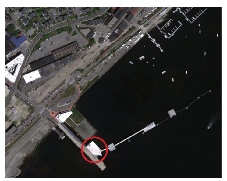
2012: Portland Seaport Improvements

Importance of current aerial imagery as source for land use change detection.